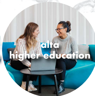
alta higher education