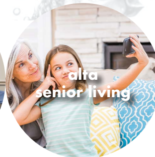
alta senior living