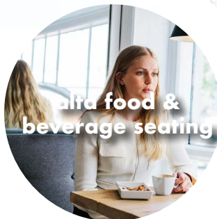
alta food & beverage seating

This powerful duo can be applied to virtually any textile and create durable environments that don't compromise on beauty or comfort.